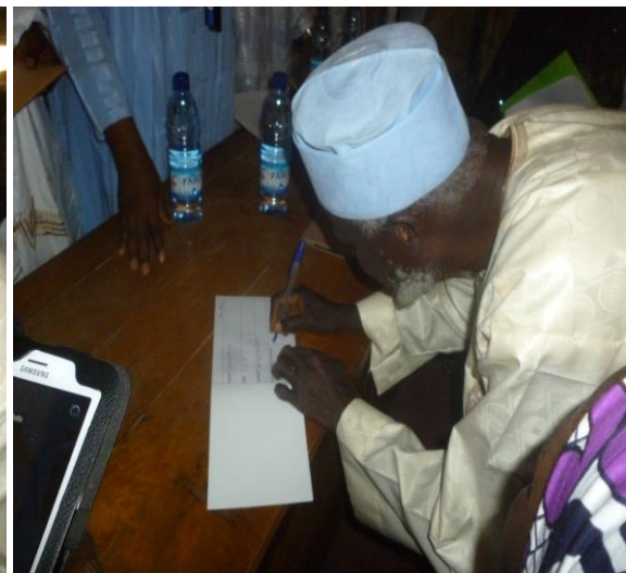
The PHCDA Chairman with Government representatives facilitating the disbursement of stipends to Foster Parents for the month of January 2017 in Maiha LGA