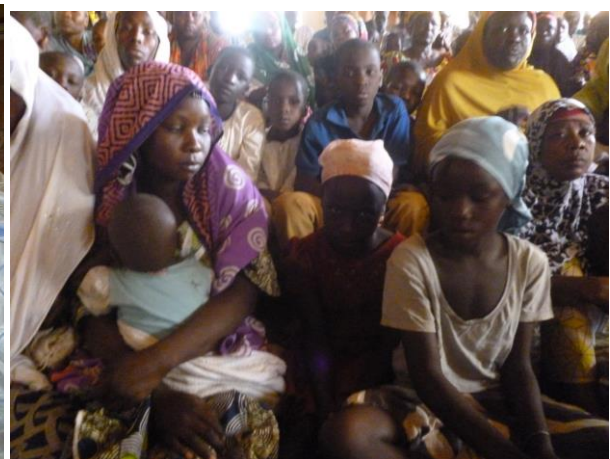
CPC, Foster Parents and children during the flag off of stipends payment